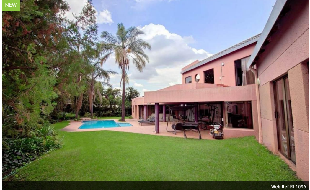
Web Ref RL1096

Cnr Leslie & William Nicol 128 Leslie Road Spaces -Building 2 Design Quarter Fourways, Sandton 2191