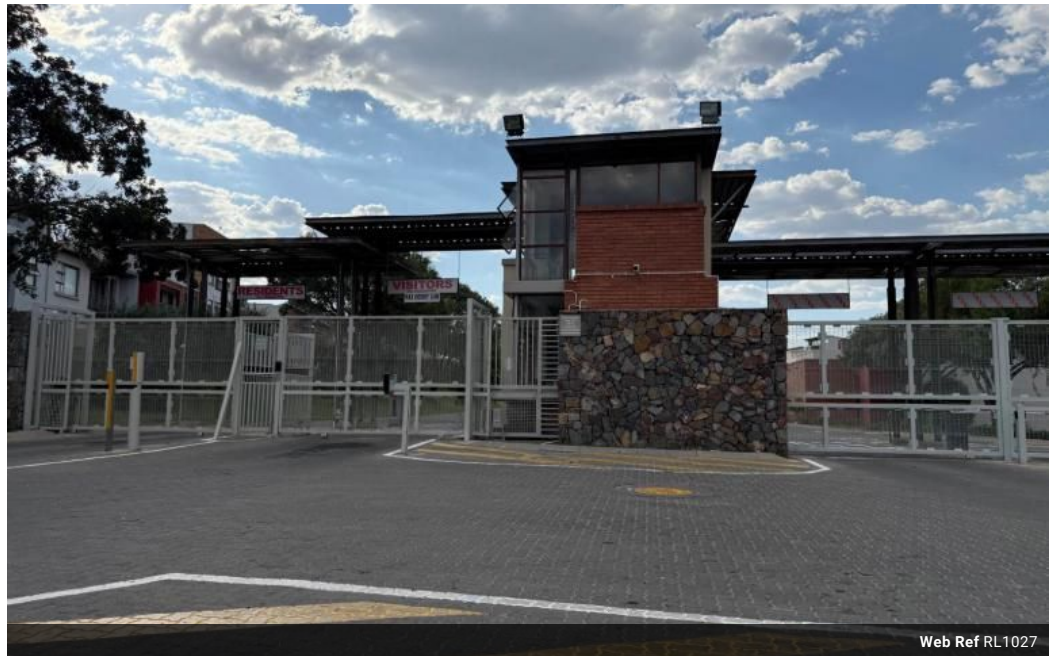
Web Ref RL1027

Cnr Leslie & William Nicol 128 Leslie Road Spaces -Building 2 Design Quarter Fourways, Sandton 2191