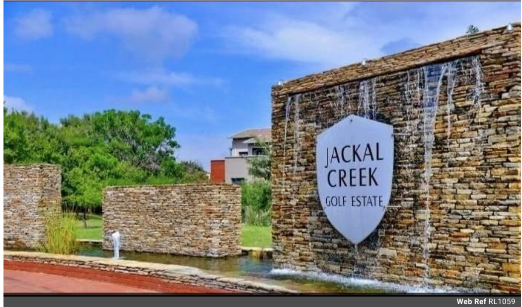
Web Ref RL1059

Cnr Leslie & William Nicol 128 Leslie Road Spaces -Building 2 Design Quarter Fourways, Sandton 2191