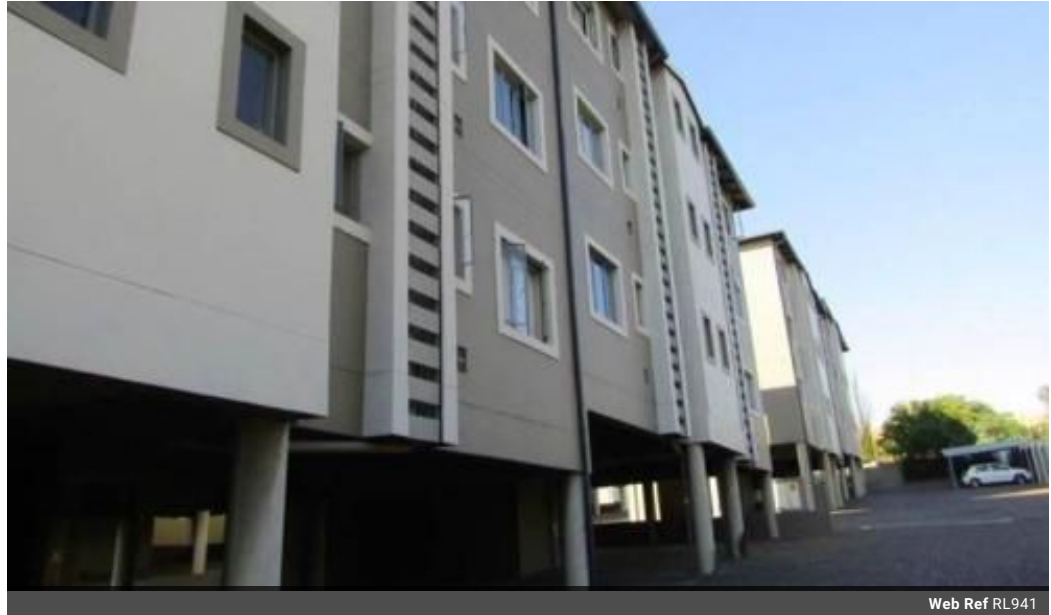
Web Ref RL941

Cnr Leslie & William Nicol 128 Leslie Road Spaces -Building 2 Design Quarter Fourways, Sandton 2191